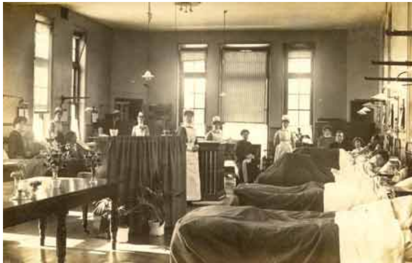
In 1915 Dr Bach was in charge of war beds at University College Hospital. At the same time, as well as researching into vaccine therapy at the Bacteriological Department he was also a demonstrator in anatomy

Edward Bach started his career as allopathic (orthodox) doctor. He began working in 1915 at University College Hospital in London specializing in bacteriology. Only two years later he became ill and resigned from his position. After two years of illness, he recovered and then began working at the London Homeopathic Hospital. This is where his interest in holistic methods really accelerated.