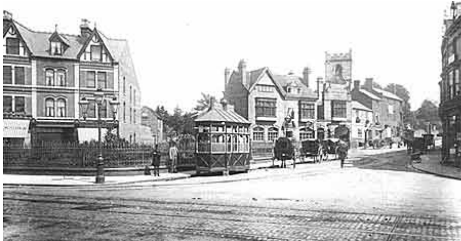
1886. Edward Bach was the eldest of three children, two boys and a girl. Moseley, now a suburb of Birmingham, was at that time a village, situated about three miles outside the city.

Below are a few interesting historical photos and a brief summary of Dr. Bach’s life.